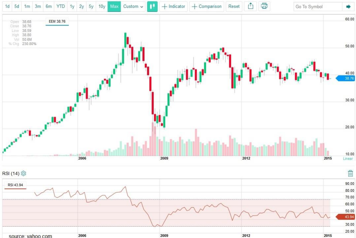
Chart 2: EEM – Emerging Market ETF