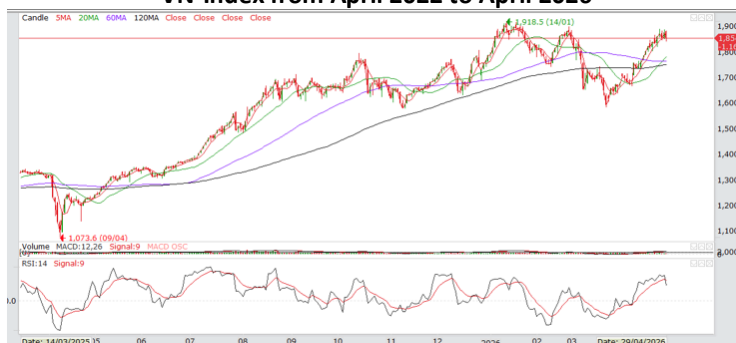
VN-Index from April 2022 to April 2026

Nearly two months after the outbreak of the U.S.–Iran conflict on 28 February 2026, global markets remain highly volatile, with continued sharp swings across major indices. In April, the Vietnamese market partially recovered from its March lows, with the VN-Index rising 10.7% in USD terms. The rebound was largely driven by Vingroup-related stocks, particularly VIC, VHM, and VRE, while the broader market lagged, as reflected in weak market breadth with decliners significantly outnumbering advancers. Against this challenging backdrop, the AFC Vietnam Fund declined by 1.1% in April, bringing its estimated NAV to USD 3,436 per share, based on internal calculations.